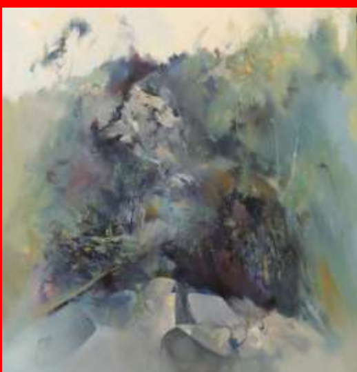
Rainforest (snobs creek) Packing Room Award