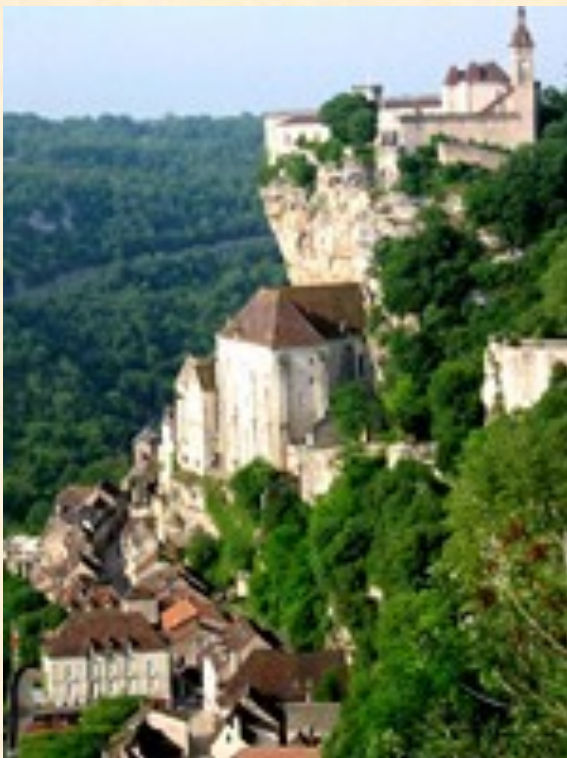
Rocamadour, our base for 10 days