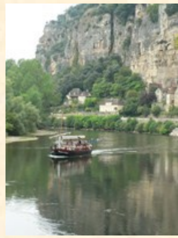
Our river cruise in Dordogne